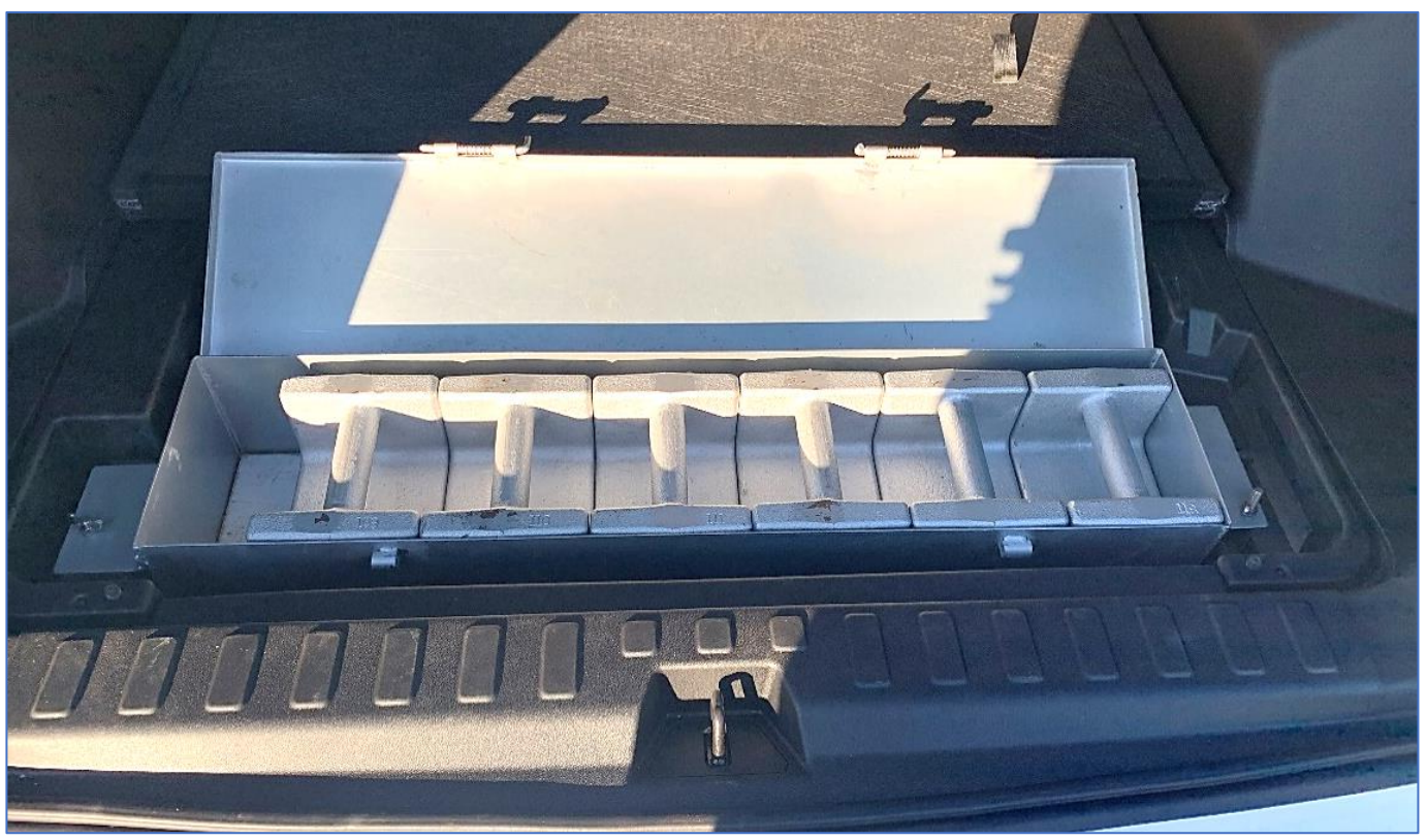
Pictured above is one of the boxes that we designed and installed in one of the new SUV's.