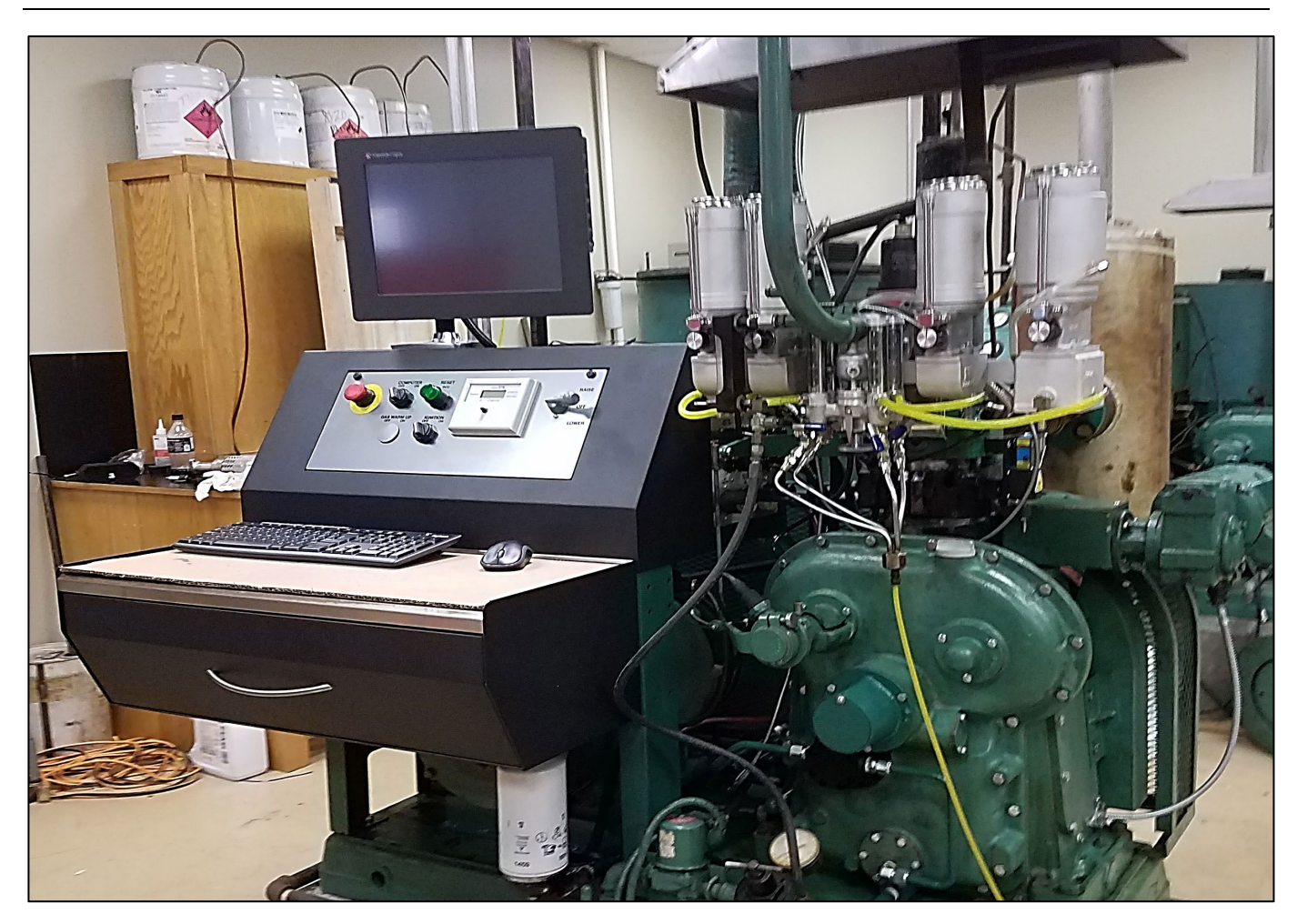
Octane engine after upgrade/overhaul by Compass Instruments.

Device and Package Program- We have continued our efforts to create a comprehensive Field Training Manual along with assessments, which will synthesize NIST Handbooks and Louisiana Laws, Rules, and Regulations, so that we can more easily and thoroughly train our inspectors. The latest course to drop is Weighing Devices, in which inspectors can learn all they need to know about inspecting, testing, and regulating scales in Louisiana. We are beginning the process of upgrading our inspectors package inspection scales, and have started an initiative to greatly increase the amount of packaged goods we inspect each year.