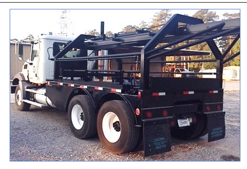
One of our three current HD test trucks.

Professional Development- As part of our Professional Development efforts, our inspectors and middle managers are continuing to take the NCWM Exams. Team members have passed 14 Basic Competency Certifications, and three have earned one Professional Competency Certification. Our goal is for all team members to achieve as well as maintain at least one NCWM credential.