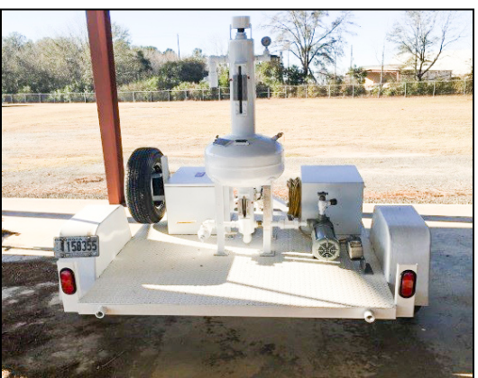
New Heavy Scale Inspection Tuck